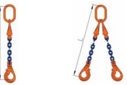
SINGLE LEG TWO LEG