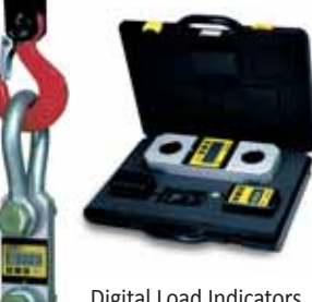
Digital Load Indicators over 100t are available.

Download software and leads are available which allow results to be downloaded to a PC for inclusion in the method statements etc.