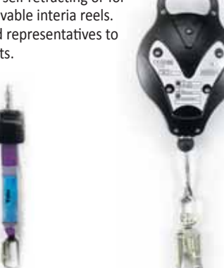
Retrievable Mini Block